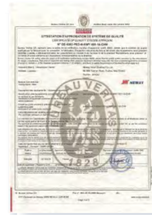
$ & 1 & %